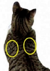
Sites to insert the needle

NOTE: Some cats are more cooperative if they are placed in a box not much larger than the cat. A cardboard cat carrier is often the correct size. Alternatively, some cats respond well to being held in a towel that covers their head during the procedure. Experiment with different locations and techniques until you find the most comfortable technique for you and your cat. Always reward your cat after the procedure with a tasty treat.